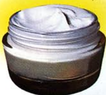
Talk about a radiant complexion.

special blue light, so when a doctor directs this beam onto affected areas, it kills zit-causing bacteria and reduces inflammation. A patient with mild-to-moderate acne would need about 8 to 10 treatments to clear things up (more if acne is severe). Occasional follow-up visits maybe required. Prices range from $50 to $100 per session.