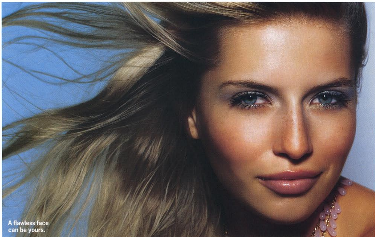
A flawless face can be yours.