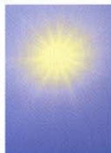
The sun’s rays are strongest at midday.

Even if you’re not basking on the beach (you aren’t, right?), the sun’s rays are still battering your looks as you walk around or drive in your car. Thankfully, there’s a powerful new ingredient in the sun-protection pipeline: Mexoryl. Most sunscreens protect