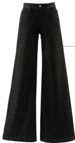
Uniqlo wide-leg ($60) With a dressy charcoal-gray weave, no rivets and a wide leg for a chic, relaxed fit.

HILLAR CAN SHE DO IT? (Do we want her to?)