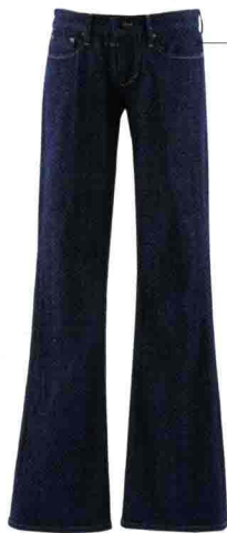
Joe's JetRocker ($158) Business-like classics with a subtle high rise and enough polish for a blazer pairing.

How to make an entrance bluff at p kick you CrackBe habit and 18 o things yo should k by now