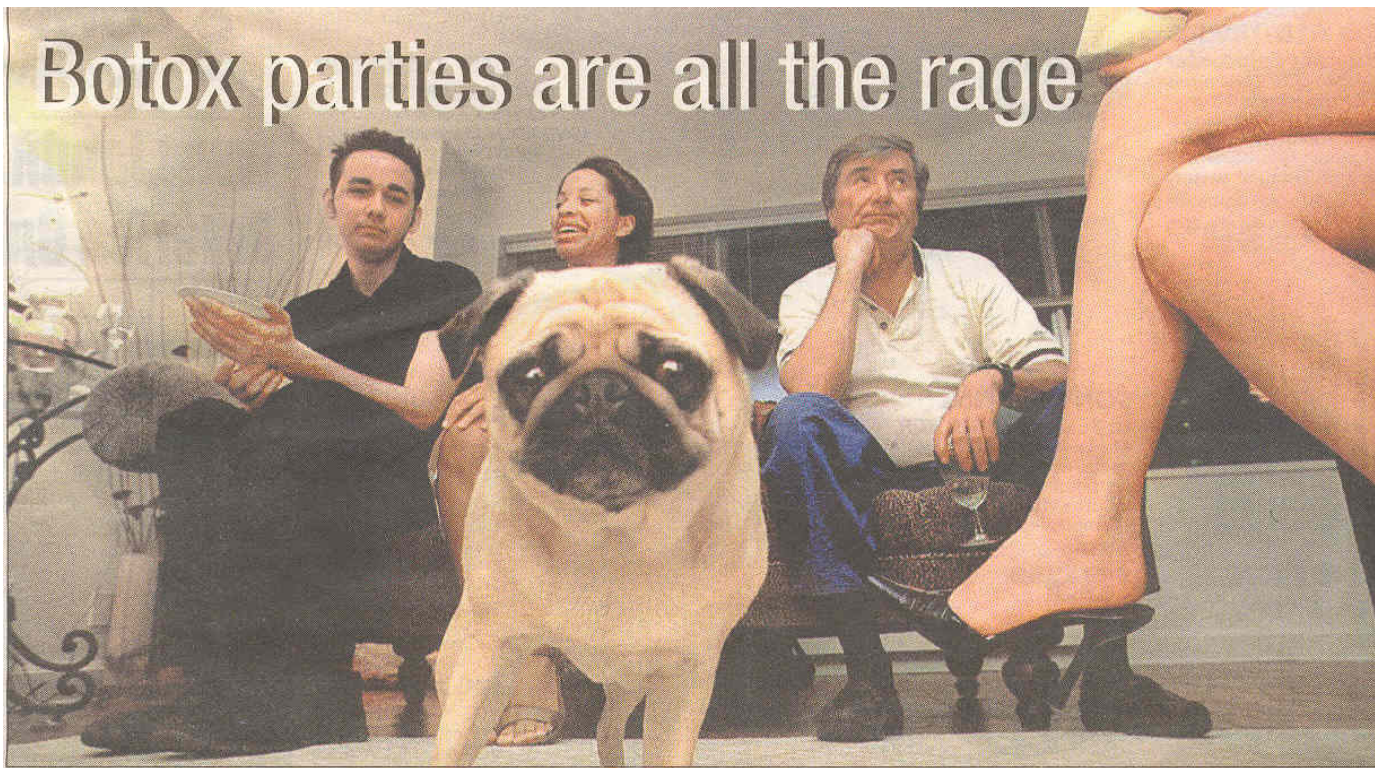
The only guest who left this Upper East Side Botox party with wrinkles intact was this cute little pug, Roxy.